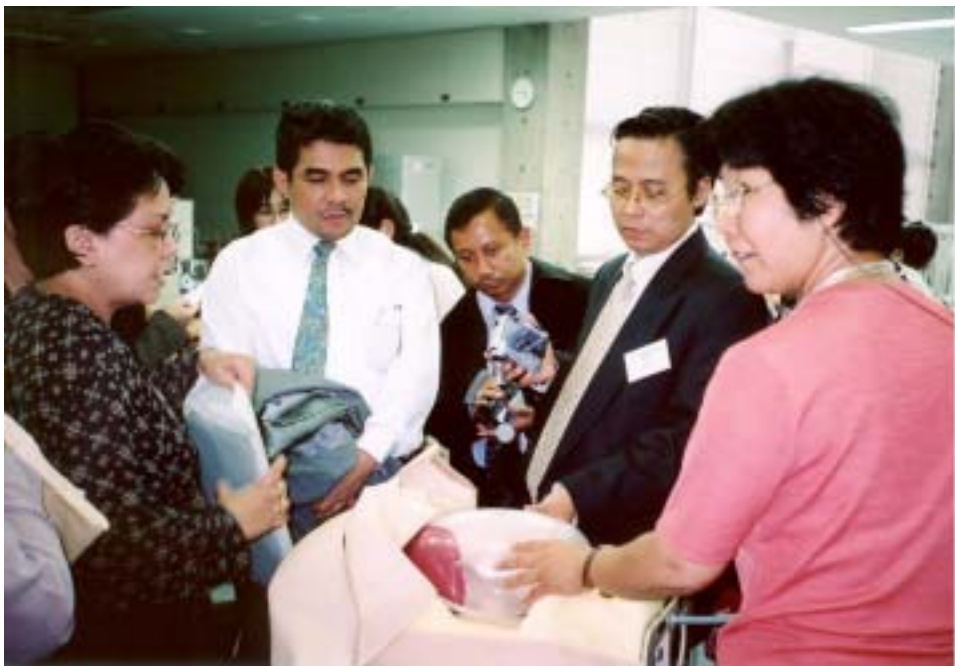
Saitama Prefectural University (September 1 st 2004)

Staff of Children's Castle is explaining the play activities for children.