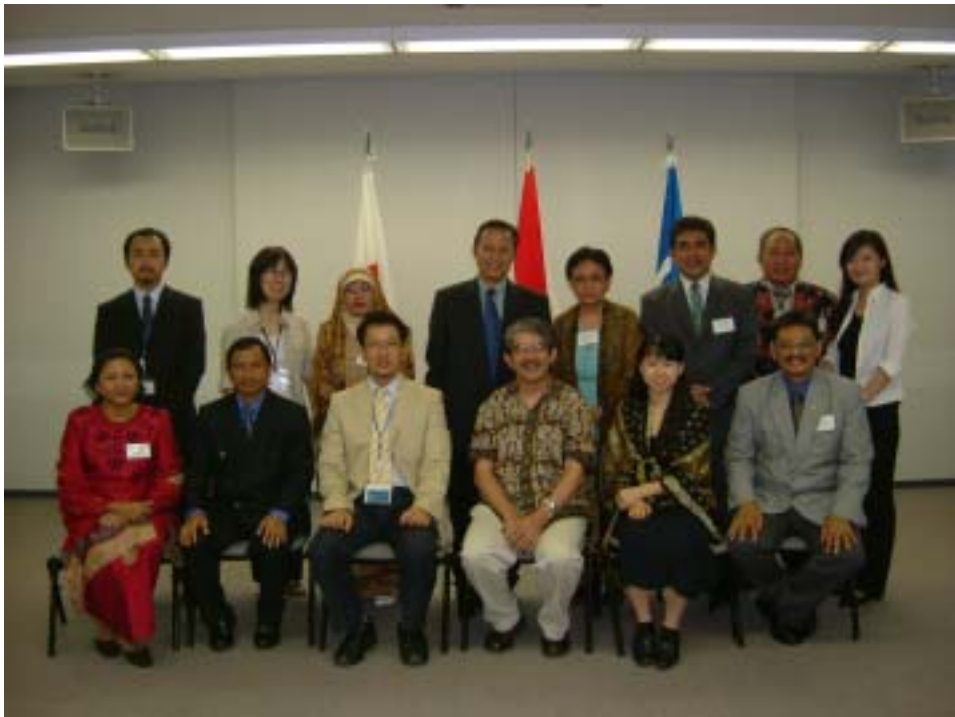
Closing Ceremony (September 14 th 2004)

Indonesian Participants is writing Plan of Action based on the experiences that they have learnt through this training course.