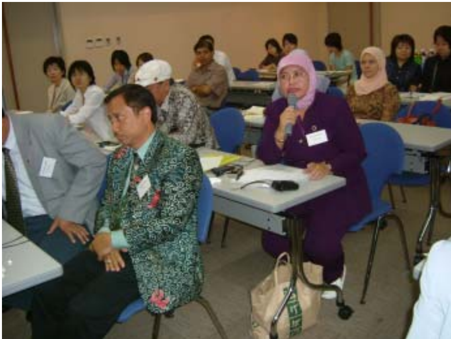
Symposium on Maternal and Child Health in Indonesia (September 11 th 2004)