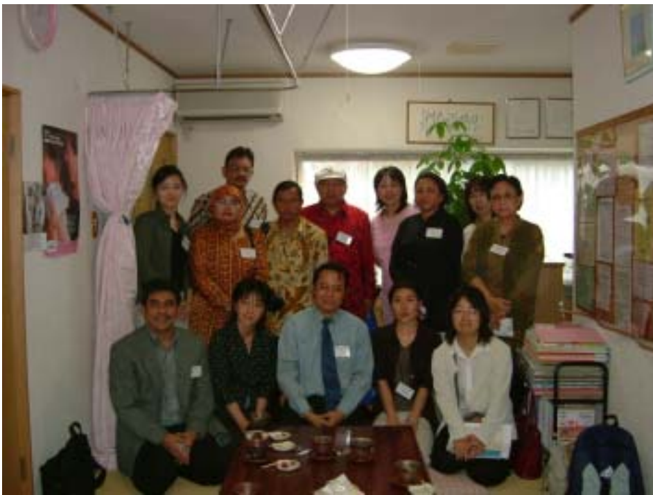
Mana Maternity Home (September 10 th 2004)