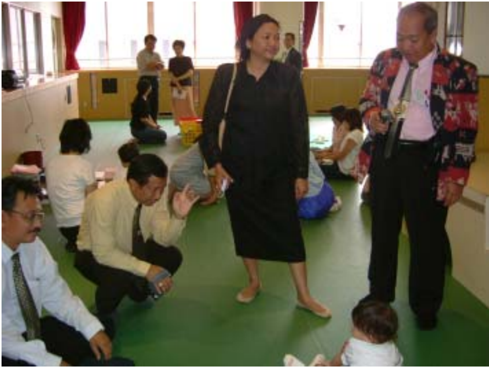
Kobe General Children's Center (September 7 th 2004)

Indonesian Participants are joining in “Class for Extremely Low Birth Weight Babies and their Parents” at Kobe General Children’s Center.