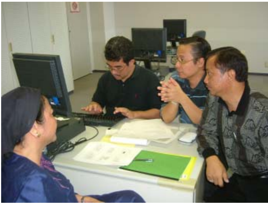
Making Plan of Action (September 12 th -14 th 2004)

Indonesian Participants is writing Plan of Action based on the experiences that they have learnt through this training course.