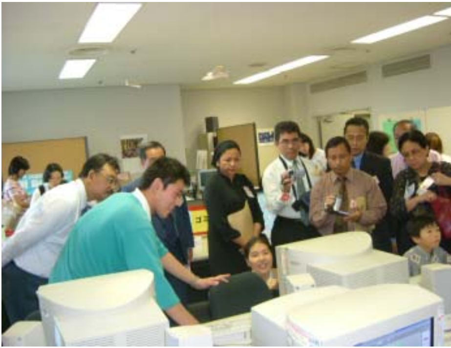
Mothers' and Children's Health and Welfare Association / Children's Castle (August 30 th 2004)

Staff of Children's Castle is explaining the play activities for children.