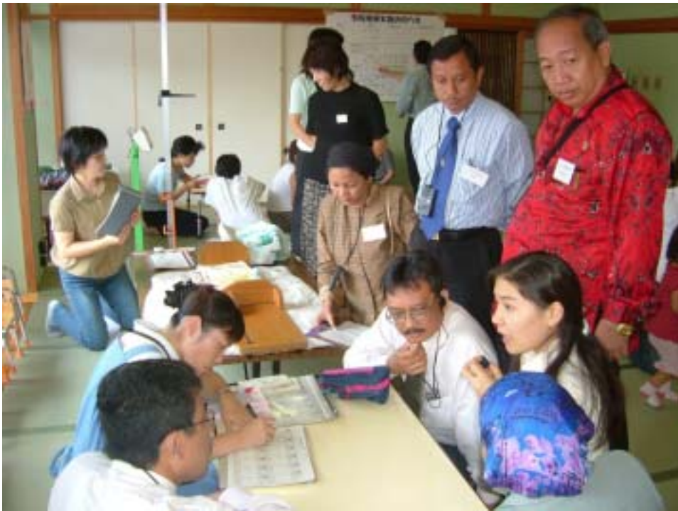
Yashiro Town Health Center (September 8 th 2004)

Indonesian Participants are joining in “Class for Extremely Low Birth Weight Babies and their Parents” at Kobe General Children’s Center.