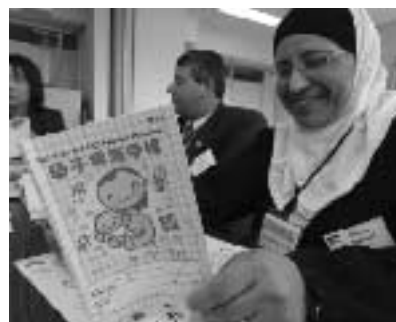
Palestinian trainees study English translation of MCH Handbook

HANDS was asked by JICA to hold a training course in Japan in February 2006 on the "Development and Promotion of the Maternal and Child Health (MCH) Handbook in Palestine" for seven Palestinian trainees, who were members of the MCH Handbook task force of Palestinian Ministry of Health. The trainees visited health centres and attended lectures to learn how effectively the MCH Handbook was utilized in conjunction with MCH services in Japan; finalized the draft of the Palestinian MCH Handbook with the inputs from experts; and developed a dissemination plan for the Handbook in