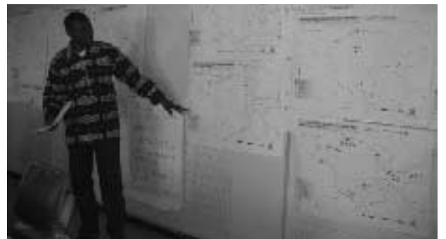
Workshop participants write data on the maps to analyse priority issues.

The Zambia Health Facility Census ('HFC') has been conducted by the Ministry of Health of Zambia, in technical and financial collaboration with JICA. The objectives of the HFC are to collect the data on health facilities, analyze the data and utilize the results of the analysis for the evidence-based planning of health policy and programmes. HANDS has been regularly dispatching a staff member to Zambia for technical assistance.