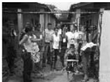
Local people weighing a child during a joint training conducted by HANDS and local NGO

From August 2006, HANDS will further support the improvement of health status of community people in Manicore by implementing the project "Healthy